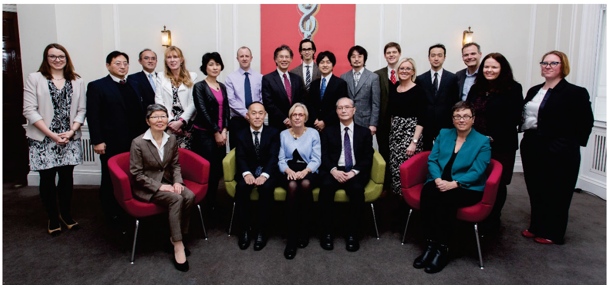
Speakers and co-Chairs at the symposium